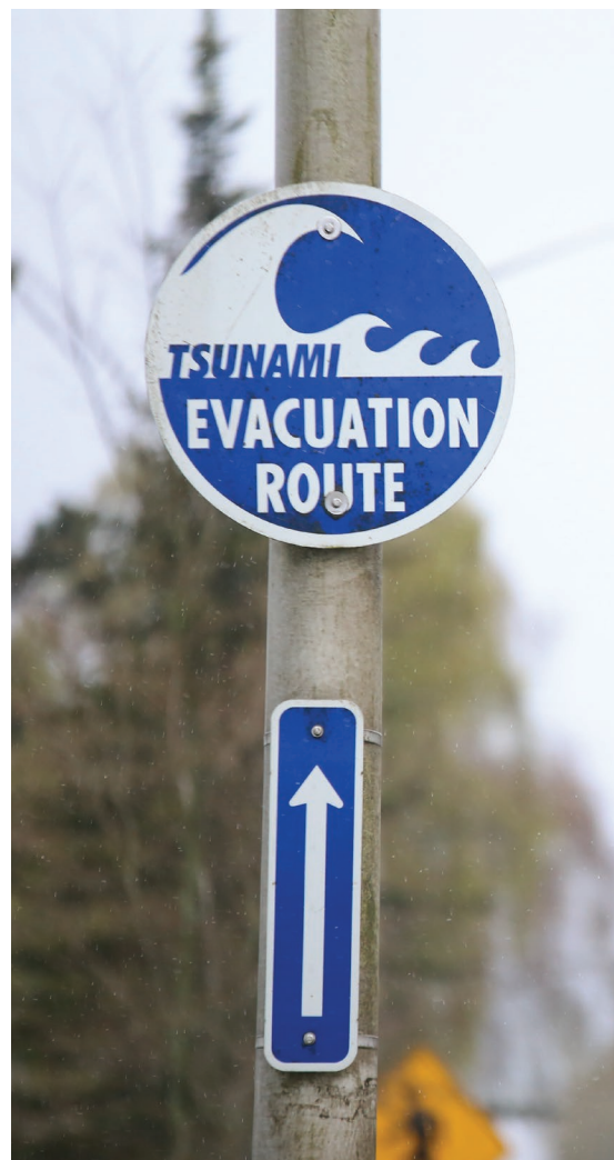
Tsunami Evacuation Route sign.

Washington State places a priority on community resilience. The Resilient Washington Subcabinet Project Team and EMD produced the 2017 Resilient Washington Subcabinet Report: Findings and Recommendations that states as Recommendation #9: “Improve life safety in communities at risk for local tsunamis.” This manual fits into the continuum of these many and diverse efforts.