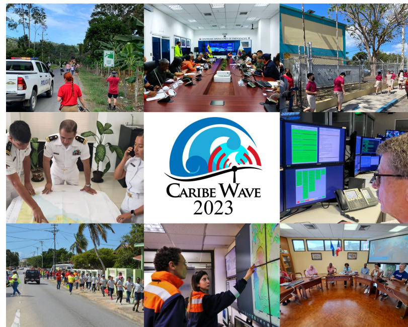
Pictures from top to bottom, left to right, Costa Rica, Venezuela, Puerto Rico, Mexico, PTWC, Aruba, Colombia and Guadeloupe.