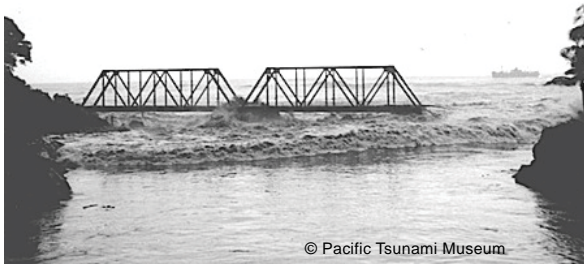
Aleutian Islands tsunami attacking Hilo, Hawaii, 1 April 1946