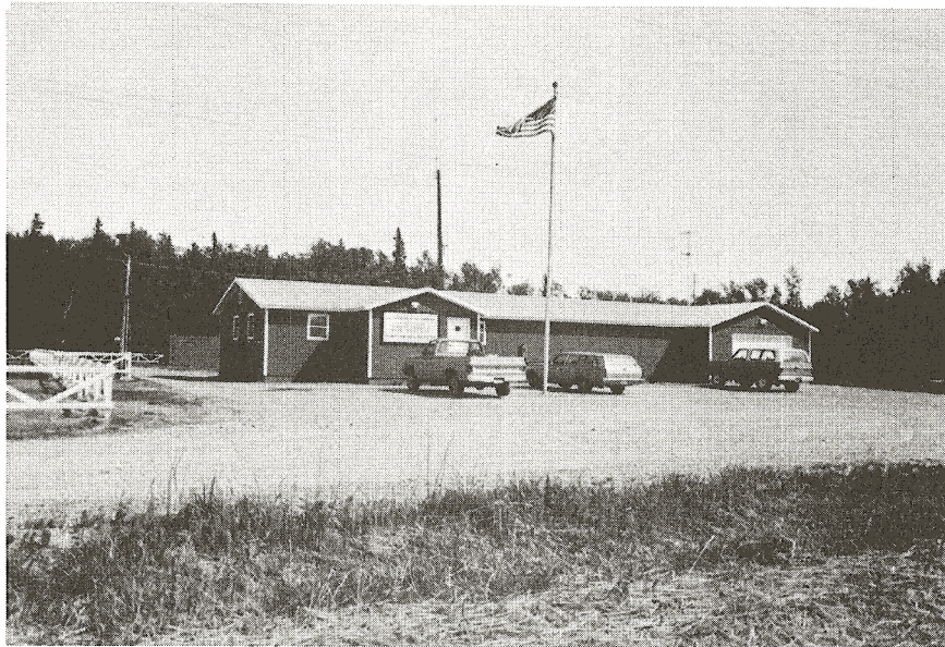
Headquarters for the Alaska Tsunami Warning System at Palmer

10. Provides logistic and technical support for all seismic, tide, and tsunami systems in Alaska.