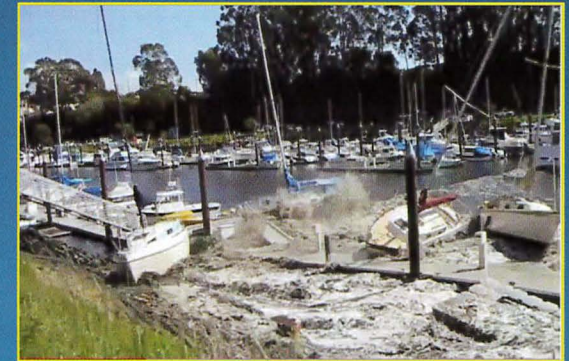
The March 11, 2011 tsunami in Santa Cruz Harbor