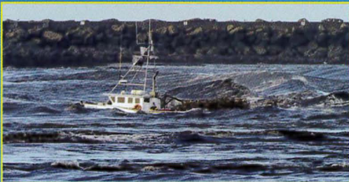
Boat attempting to leave Crescent City Harbor during the March 11, 2011 tsunami

If you do not have these essential preparedness items, DO NOT attempt to take your boat offshore. Secure your boat to the dock and leave the dock area before the tsunami arrives.