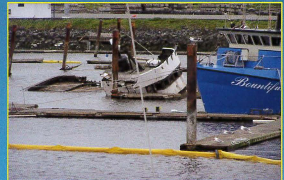
Crescent City Harbor after the March 11, 2011 tsunami