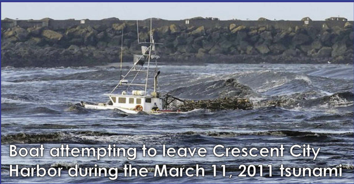
Boat attempting to leave Crescent City Harbor during the March 11, 2011 tsunami

A fisherman attempted to escape the 2011 tsunami in his boat as the tsunami was impacting the coast at Crescent City. He was lucky and was able to navigate out of the harbor, but just barely. He learned a lesson and in a video interview he shares his experience to help educate others to never risk their lives as he did.