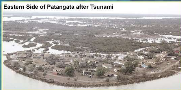
Eastern Side of Patangata after Tsunami

Census Population 2016 : 488 Location : 70km NW of Hunga Tonga