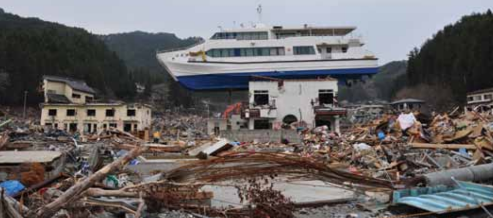
Boat stranded in Otsuchi, Japan, during the March 2011 tsunami.

cooperative relationship so that scientists are working with, and not against, the government as it assesses impact and responds to the needs of its people. In each ITST, UNESCO-IOC and ITIC work with government agencies and regional partners to facilitate smooth-running surveys endorsed by the country, especially if access is provided; in return, it is expected that scientists will share their preliminary findings, preferably before they leave.