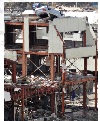
Photo: Onagawa, Japan, following 11 March 2011 tsunami event.