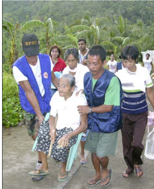
An elderly woman is carried during a pilot Philippine Tsunami Evacuation Drill in a coastal village, May 2006.

http://www.phivolcs.dost.gov.ph/index.php?option=com_phocadownload&view=file&id=34:annual-report-2006&Itemid=44