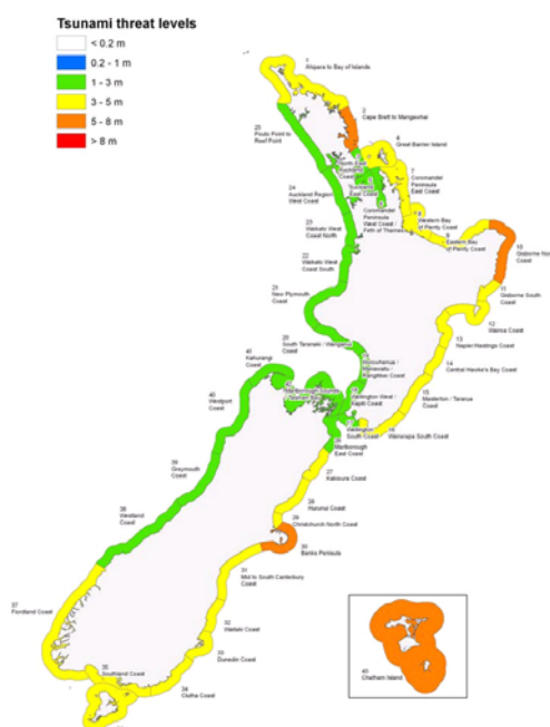
Exercise Tangaroa 2010 tsunami threat level map: The colours correspond to the maximum expected water elevation (i.e. zero-to-peak) at the coastline in metres above sea-level.

This resulted in local warnings, evacuations and welfare support within affected areas, most of them notional, but used as the basis for exercising response staff