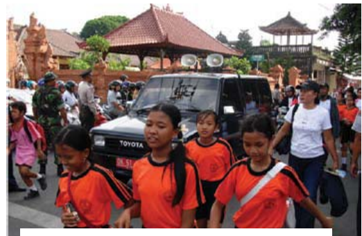
Bali school children follow a designated tsunami evacuation route as part of an Indonesian Tsunami Drill, December 2006

http://www.gitews.org/tsunami-kit/en/E4/further_resources/Guideline%20Tsunami%20Drill%20Implementation%20for%20City%20and%20Regency.pdf