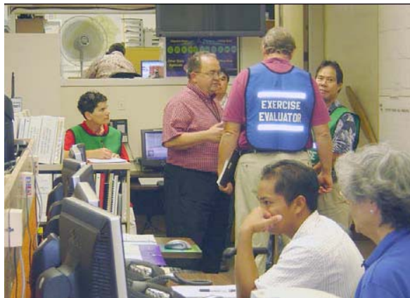
Functional style Tsunami Exercise conducted at Hawaii State Civil Defense - Emergency Operating Centre, circa 2003.

More information can be found at https://hseep.dhs.gov/pages/1001_HSEEP7.aspx